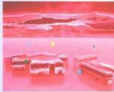
The End , oil on panel