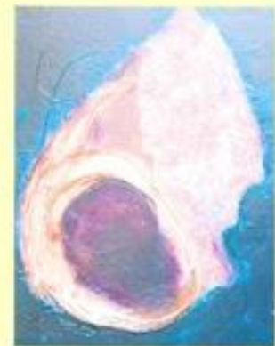
Munch's Scream japanese paper, fiber and acrylic on canvas