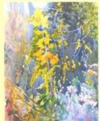
A Single Branch watercolor