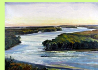
Buoy Boat at Illinois Missouri Confluence , oil on canvas, 2007