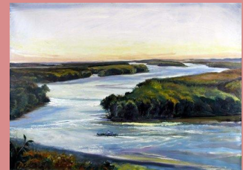
Illinois/Missouri Confluence with Buoy Boat , oil on canvas, 2008